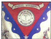
Lowell Clawson Mayor

Town of Bairoil 1101 Antelope Drive PO Box 58 Bairoil, WY 82322 307-324-7653 www.TownOfBairoil.com